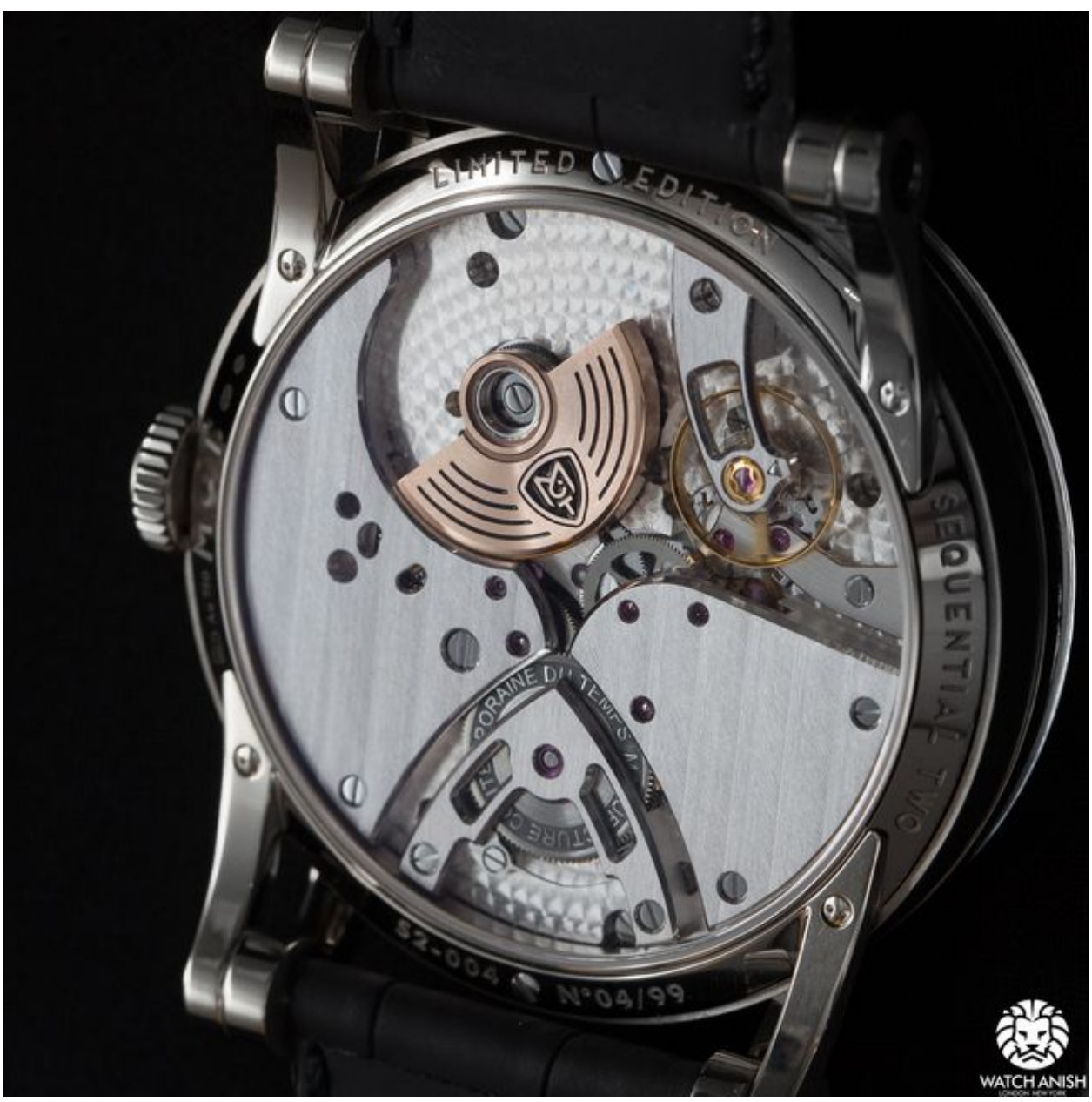
Hope you've enjoyed the article, and make sure to stay tuned as we will be live-updating the site (and of course our instagram @WatchAnish) very regularly during the Baselw0rld time.