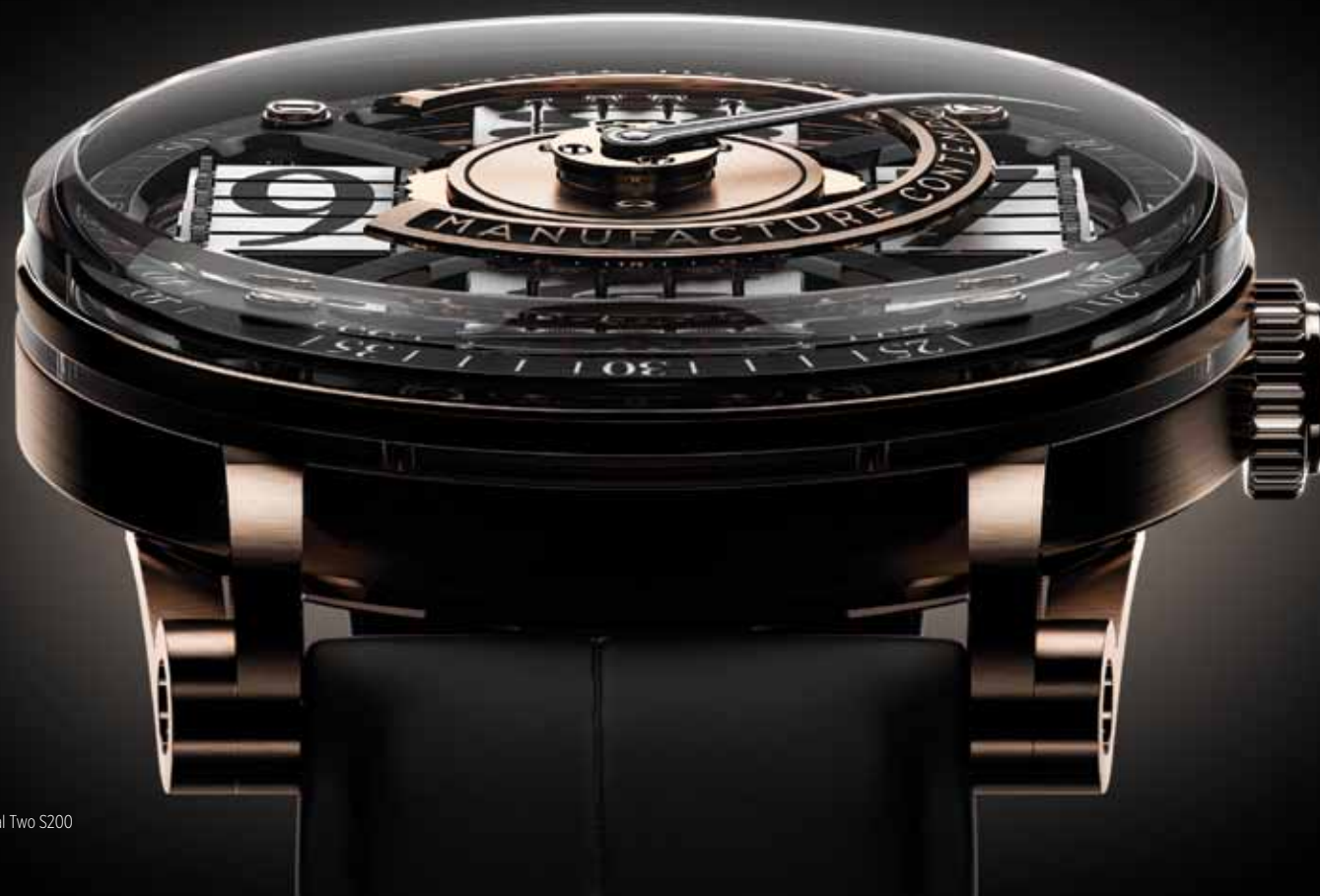
MCT's Sequential Two S200