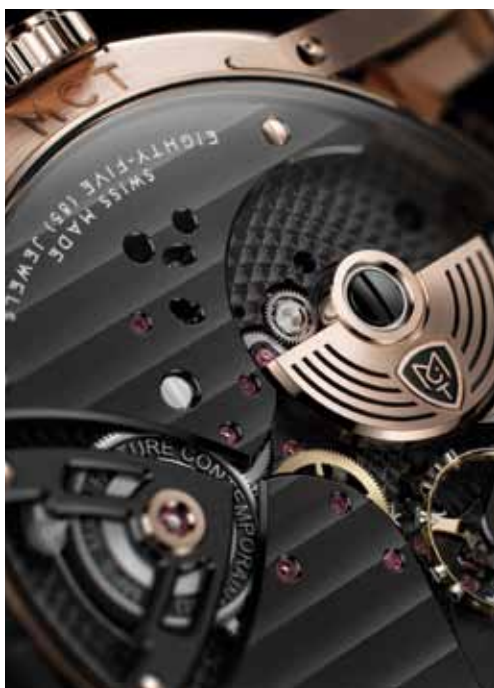
Left: The micro rotor of the automatic movement