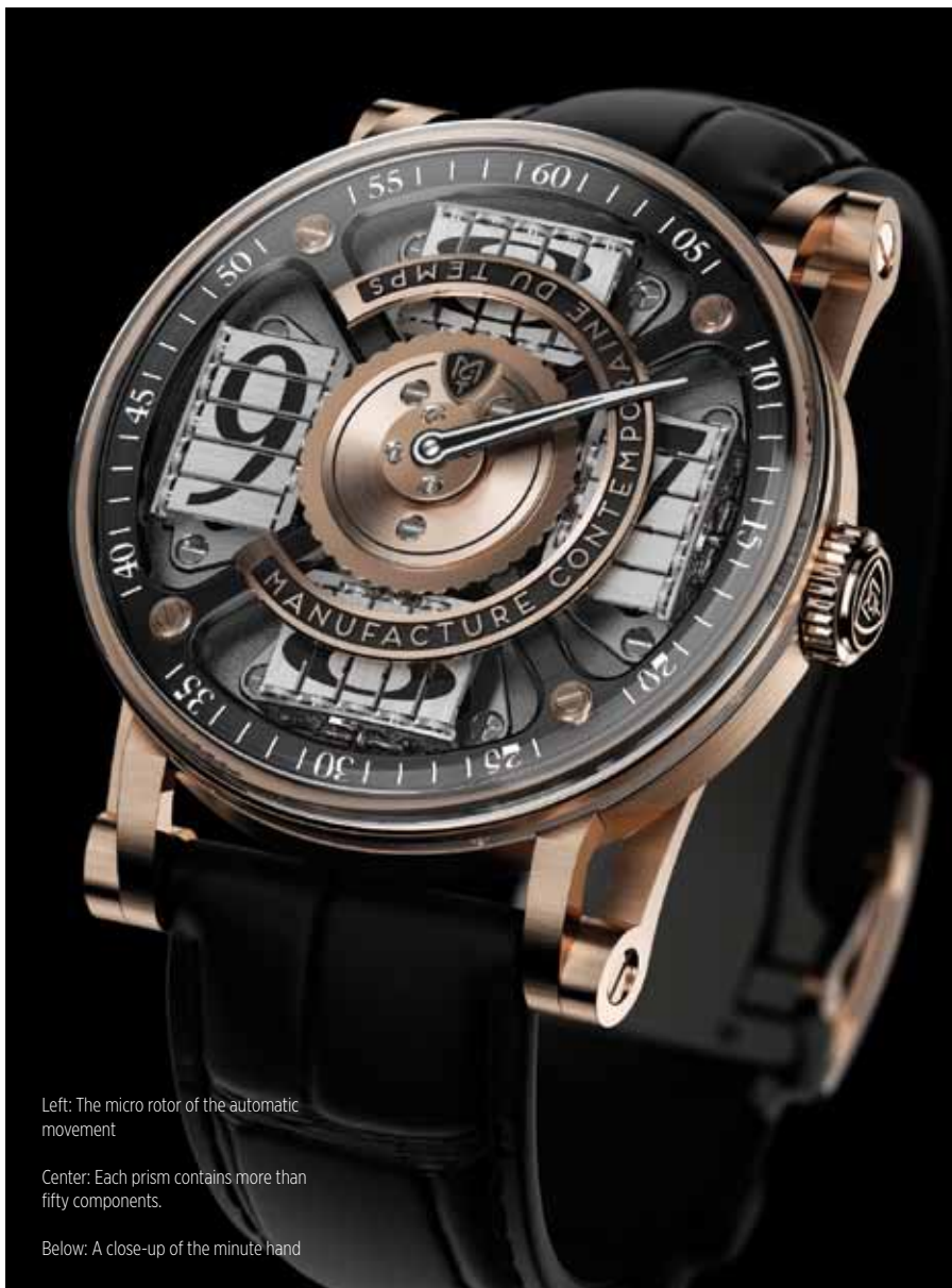
Below: A close-up of the minute hand