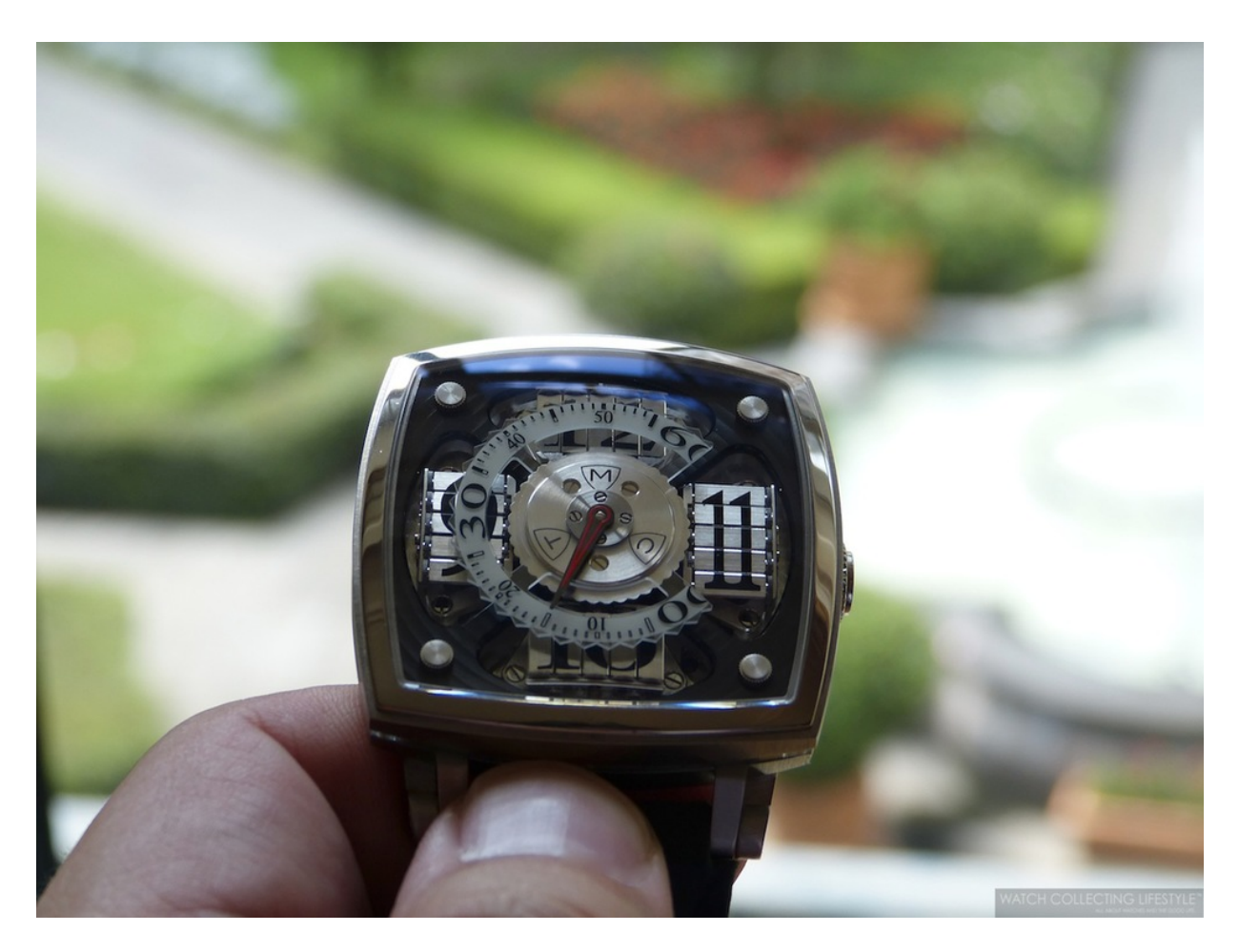
Posted on October 25, 2013 and filed under Other Brands, MCT and tagged Manufacture Contemporaine du Temps Sequential One MCT Sequential One S100 MCT Sequential One S110 Eric Giroud Jean-Francois Mojon Francois Candolfi MCT Sequential One S100 ref. SQ45 S100 WG 01 MCT Sequential One S100 ref. SQ45 S110 TI 01.